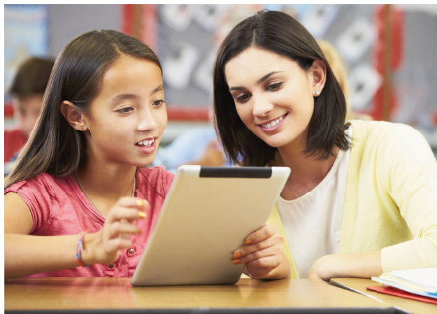
Support for early career teachers

"The IEA Online Learning Portal is a great way to earn clock hours for licensure renewal. The high quality and wide variety of informative trainings can be done at any time without having to arrange for time off from work and prepare for a substitute for a busy teacher's classes. Thanks to IEA for providing an easy and high quality way to work toward licensure renewal."